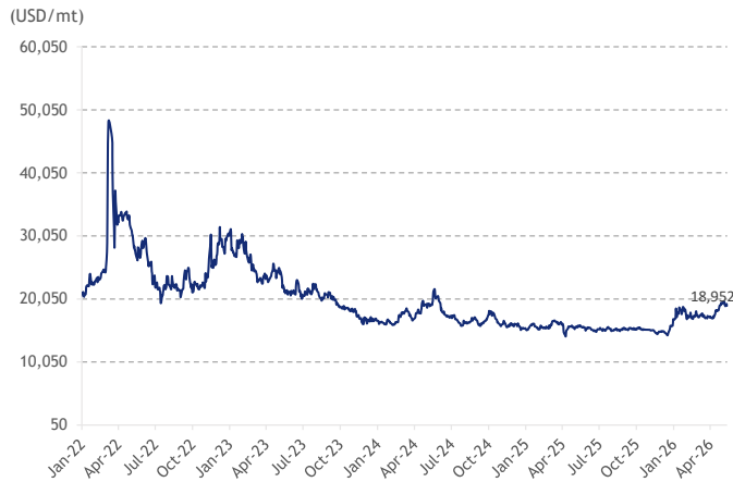
Exhibit 3. Nickel Price