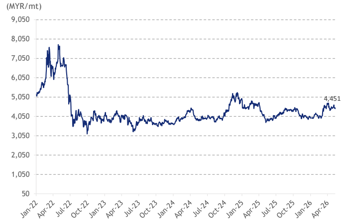
Exhibit 2. Palm Oil Price