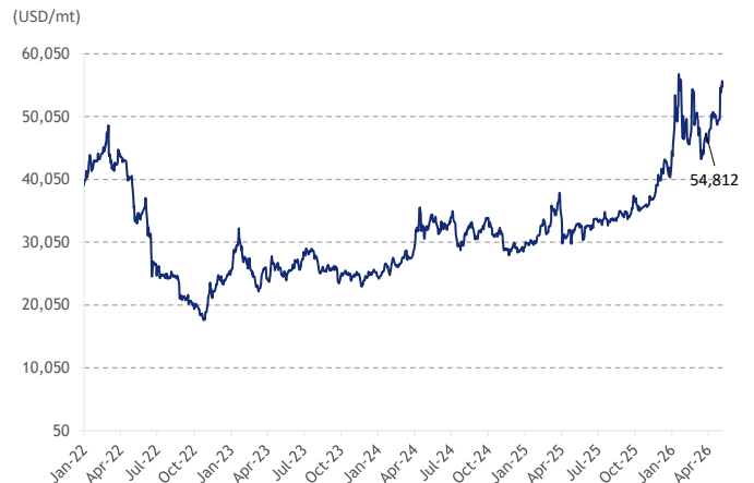
Exhibit 4. Tin Price