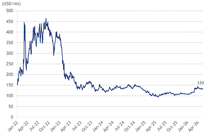
Exhibit 1. Coal Price