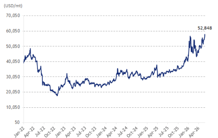
Exhibit 4. Tin Price